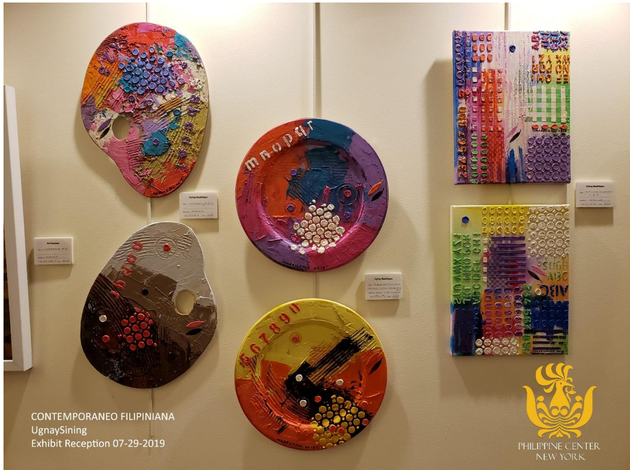
Oying Madrilejos' acrylic paintings on plywood. (Photo by Philippine Center New York)

Am artists by providing them the venue where they can promote their artwork to the Fil-Am community and mainstream American public. - END