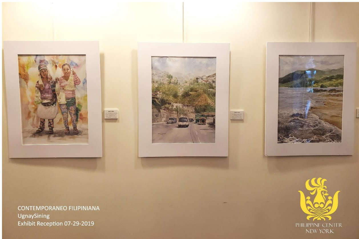
Rene Canlas' watercolor paintings (L-R) entitled "Sampaguita Vendors," "One Foggy Day in Baguio City," and "Tabing Dagat in Pagudpud."