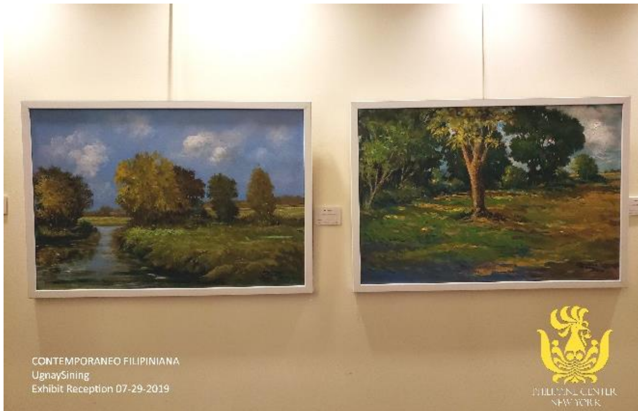
Art Zamora's landscape acrylic paintings.