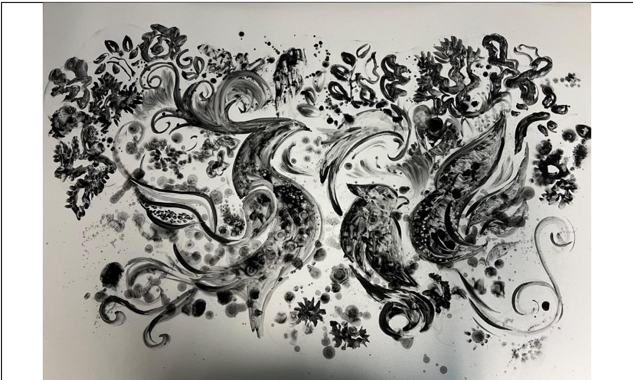
Legacy 30" x 44" 2023 Lithography