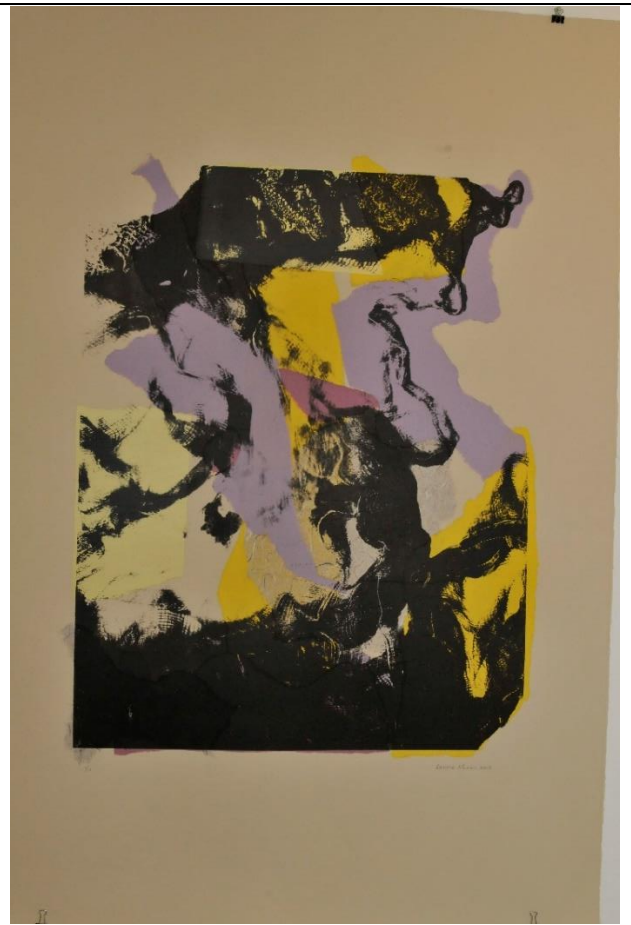
Alaala 44" x 30" 2010 Lithography